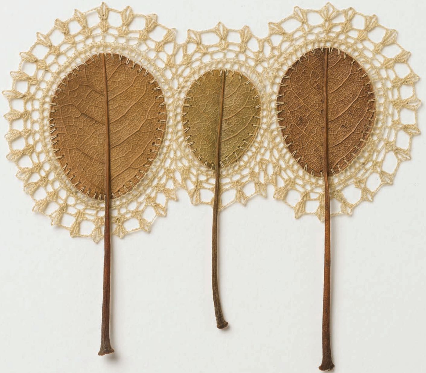
Together, 2019, magnolia leaves, cotton thread.