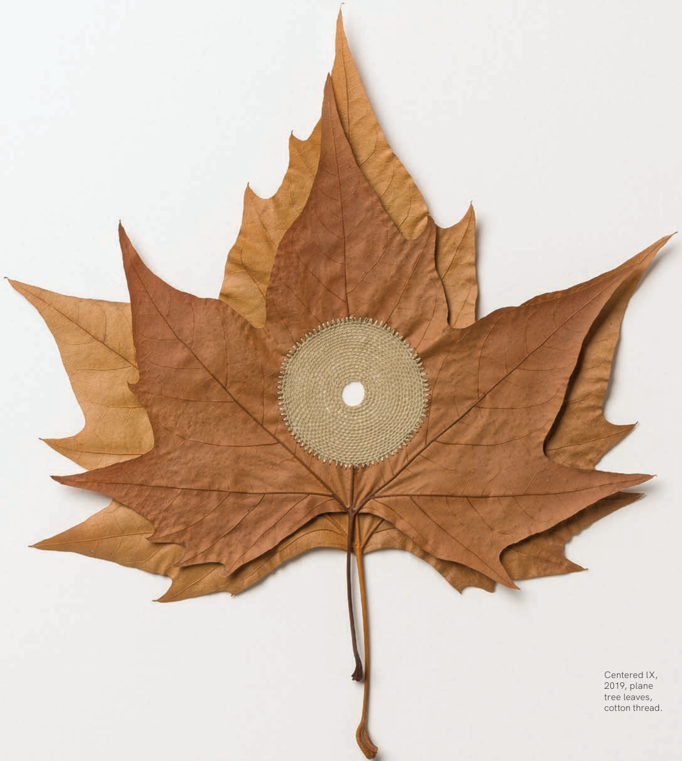
Centered IX, 2019, plane tree leaves, cotton thread.