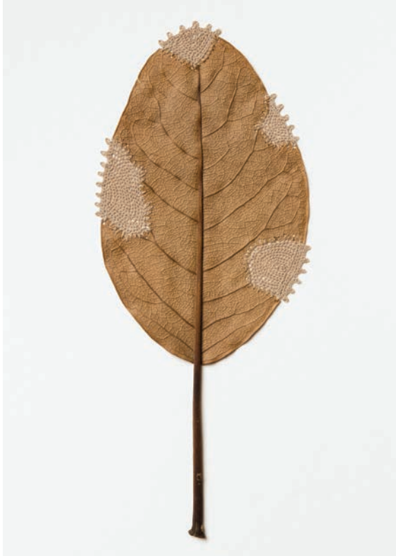
Restoration V, 2019, magnolia leaf, cotton thread.