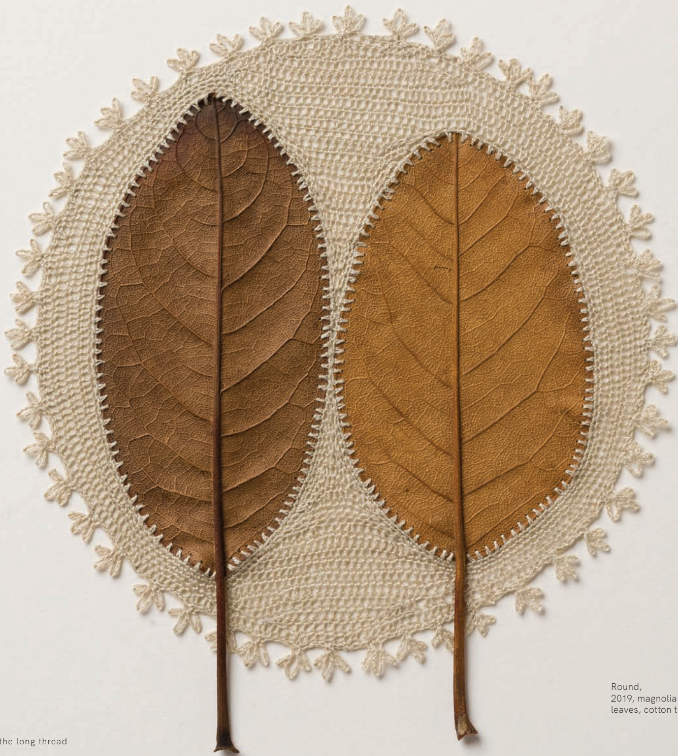
Round, 2019, magnolia leaves, cotton thread.