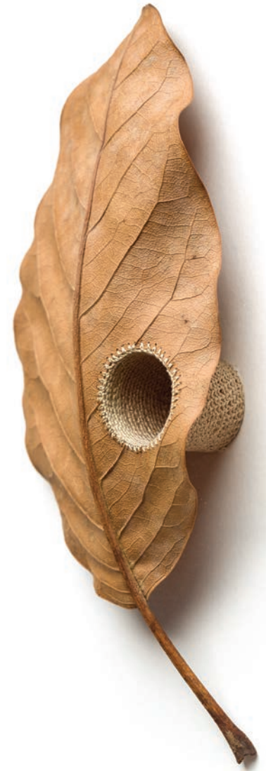
Core II (side view), 2015, magnolia leaf, cotton thread.