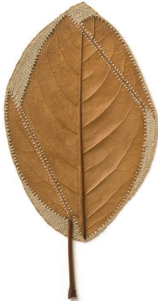
Realignment, 2019, magnolia leaf, cotton thread.

“There is a fine balance in my work between fragility and strength: literally, when it comes to pulling a fine thread through a brittle leaf or thin, dry piece of wood, but also in a wider context—the tenderness and tension in human connections, the transient yet enduring beauty of nature that can be found in the smallest detail, the vulnerability and resilience that could be transferred to nature as a whole or through the stories of individual beings.”