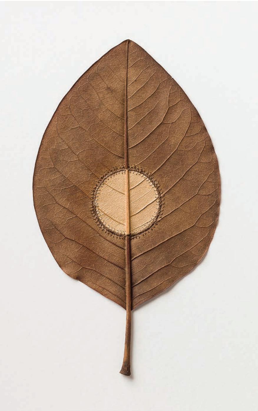
Inner Circle, 2015, magnolia leaves, cotton thread.

“There is a lot of symbolism in the juxtaposition of a technique that relies on tension and a very fragile material—also looking closely at the fine details of leaves, the veins and shapes of each individual one, all different and unique, even coming from the same tree.”