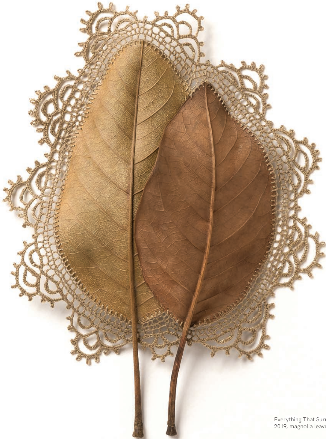
Everything That Surrounds Us, 2019, magnolia leaves, cotton thread.